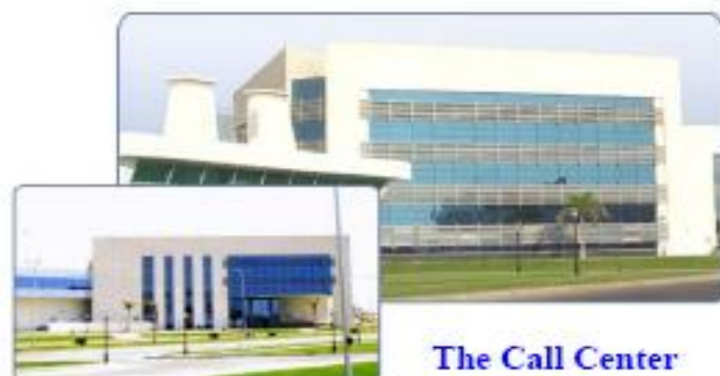
The Call Center