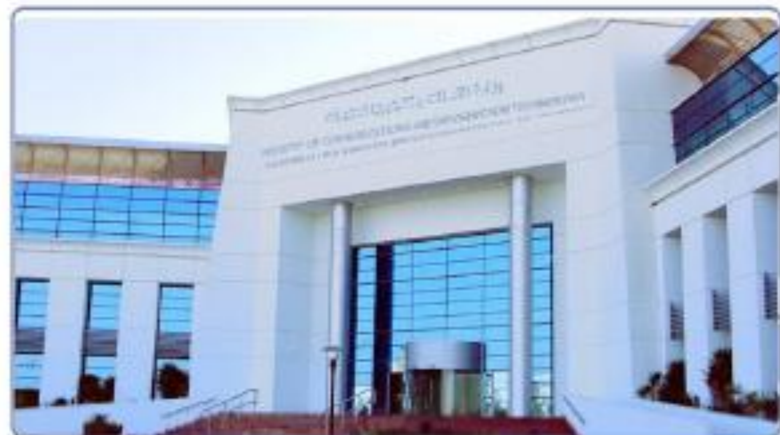
Ministry of Communications and Information Technology