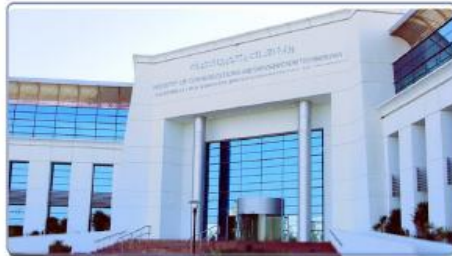
Ministry of Communications and Information Technology