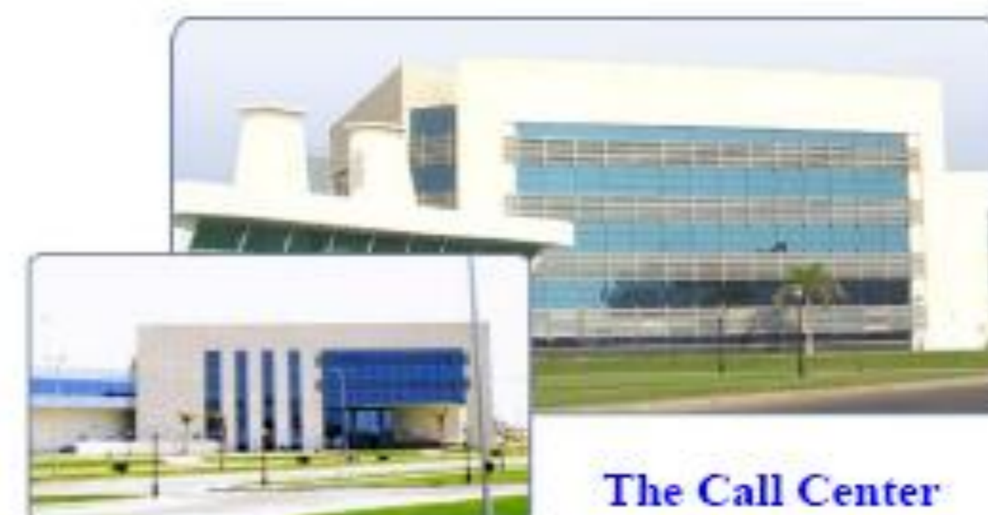
The Call Center