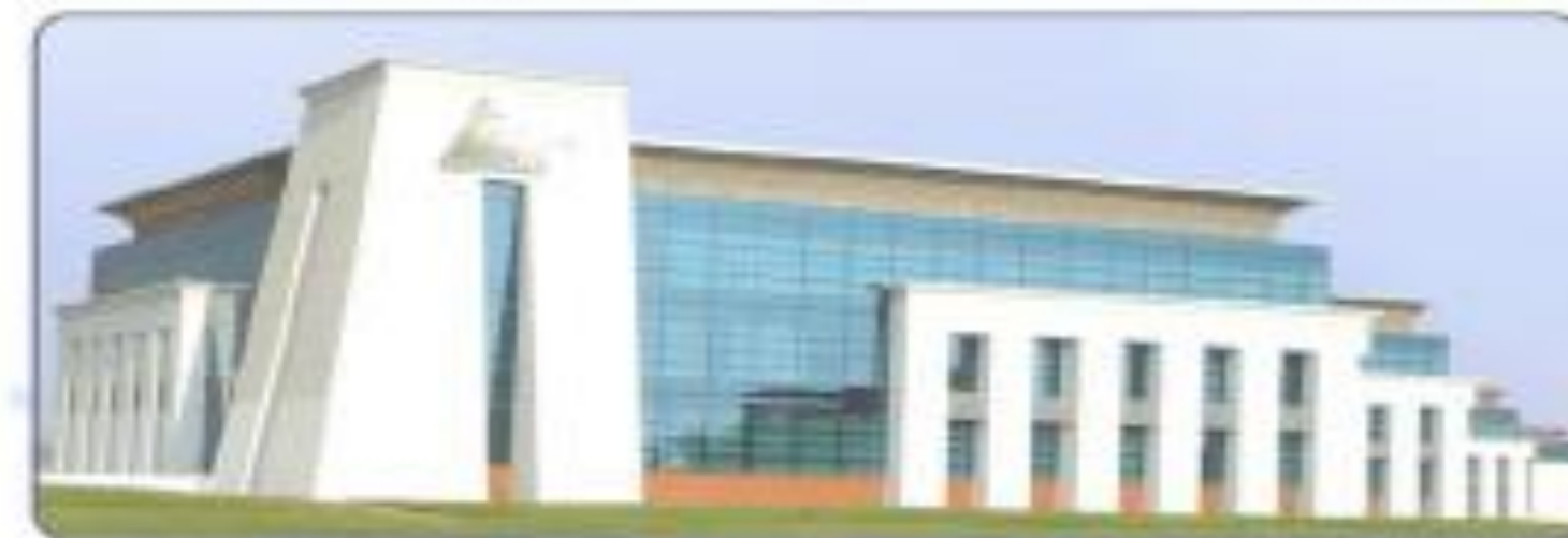
The National Telecommunication Regulatory Authority