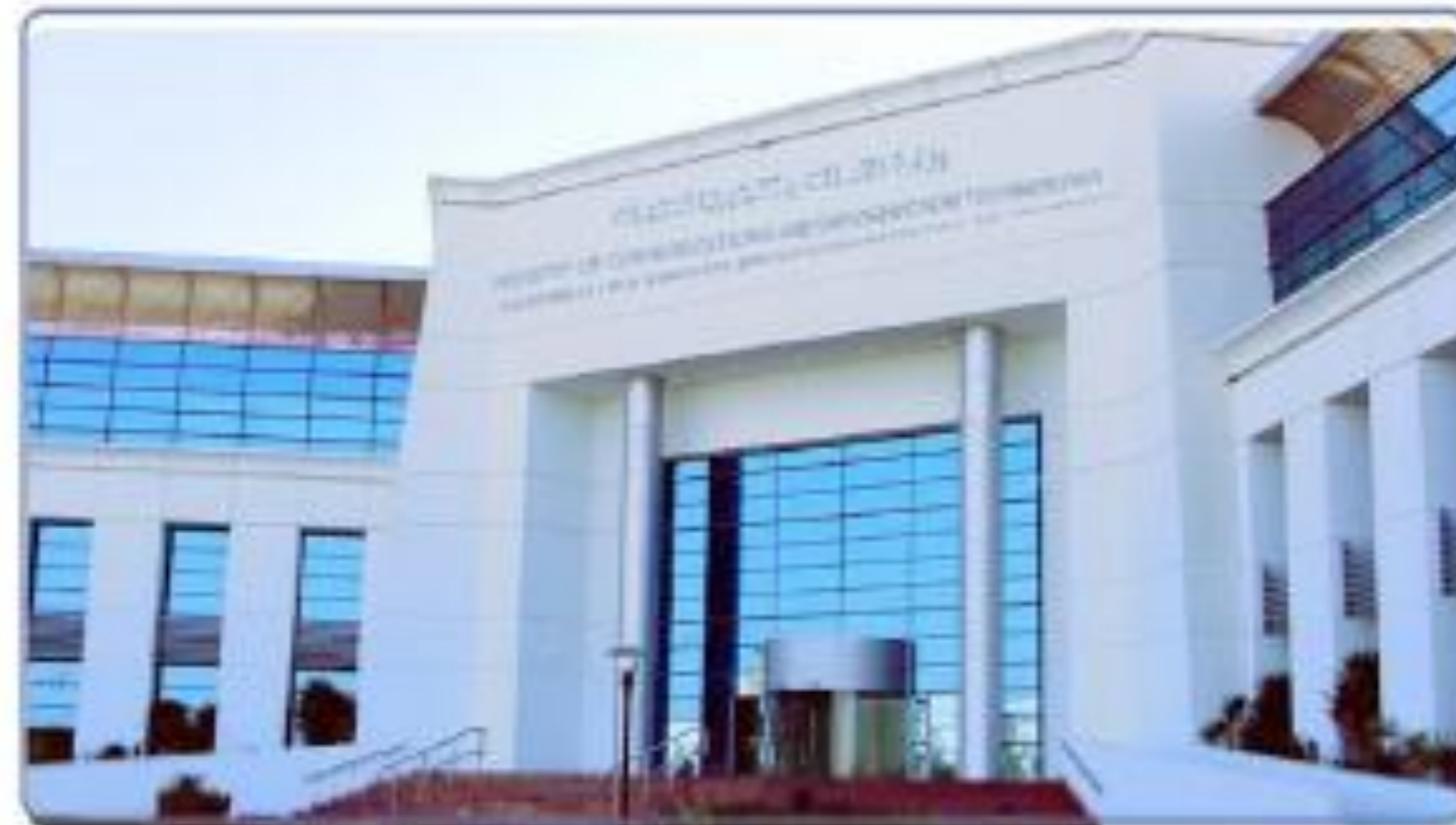
Ministry of Communications and Information Technology